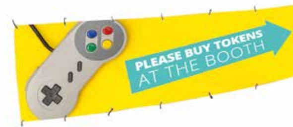
Vinyl Eyelet Banners